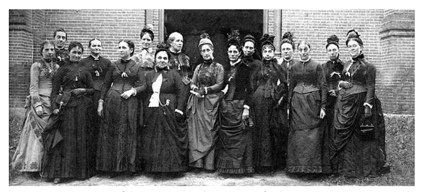
Executive Committee of the New Hampshire Women's Christian Temperance Union, 1888. Ladies of the WCTU worked to educate people and to combat one of the great evils of their day (and ours)—intoxication.